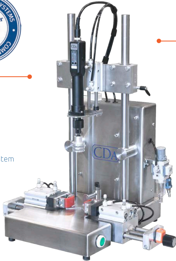
1 integrated screwing system